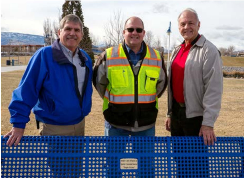
Sparks Marina Park Benches Rotary Club of Sparks and Sparks Centennial Sunrise – People of Action District Service Grant 2017-18

With the new year, we have updated Grants Policies, timelines, spending plans and other details for 2019-20. One very exciting change is Bonus District Designated Funds. Clubs will receive Bonus District Grant funds based on their Annual Fund giving three years ago. All of our District Service Grant Funds come from our Annual Fund giving three years ago; this new program will allow our Clubs to see a direct connection to and tangible benefit from their Annual Fund Giving. Check our District Website in early January for all the documents.