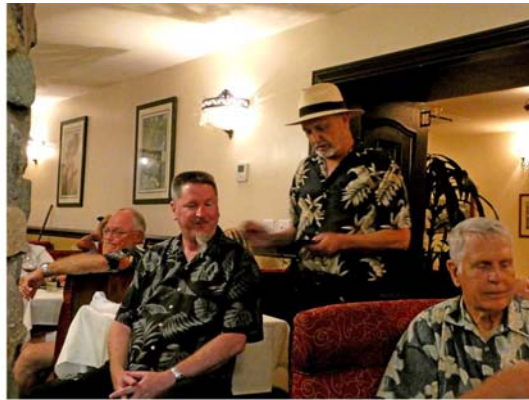
How About a Shave and a Haircut?