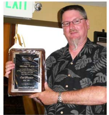
A nice memento