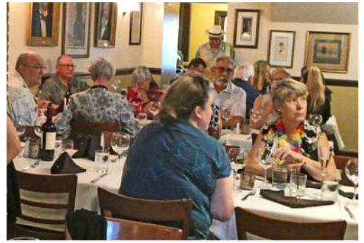
A good turn out