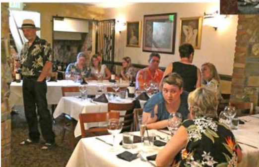
Lots of happy folks