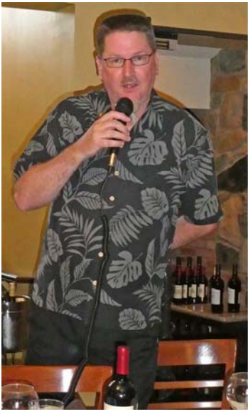
A few final words