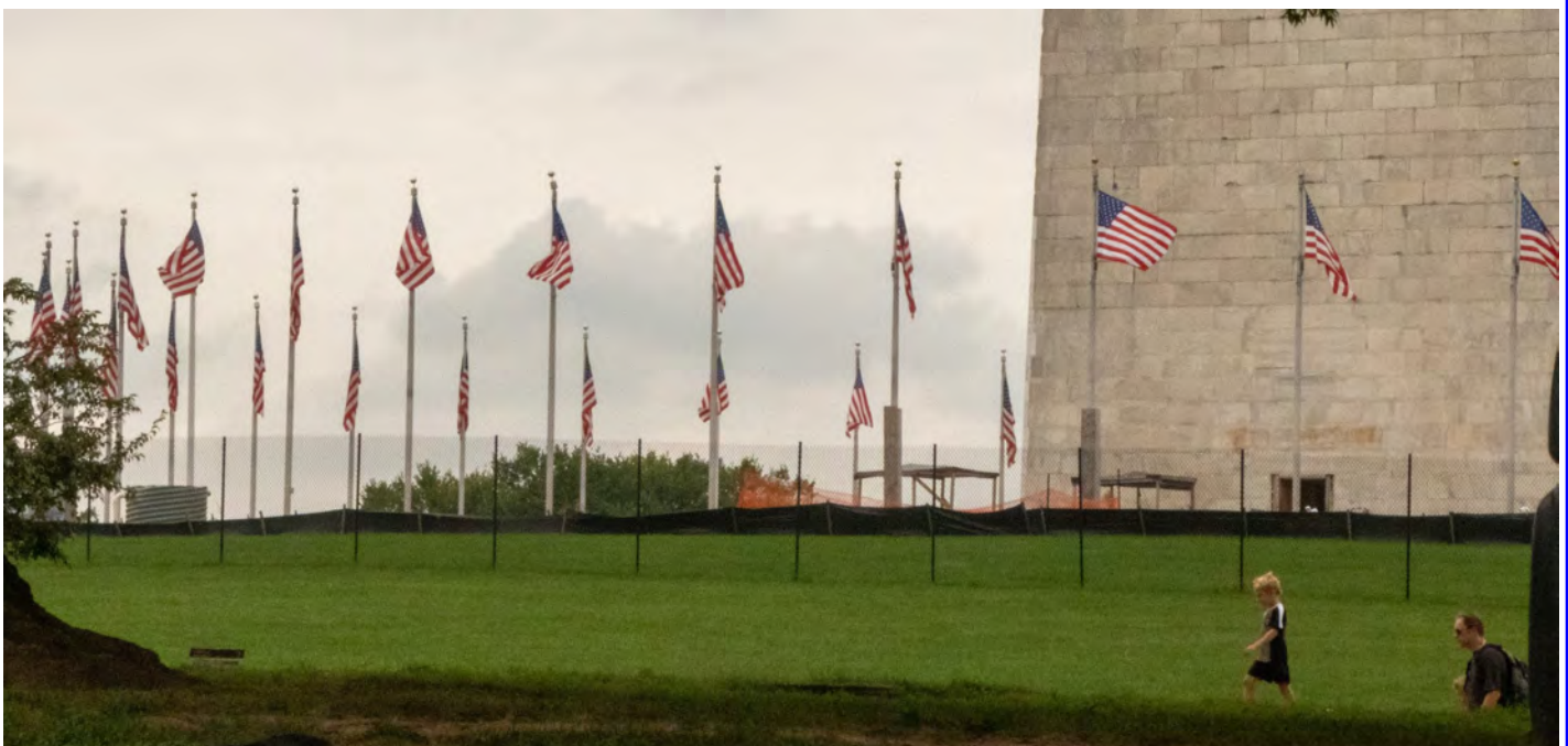
American Flags surround Washington Memorial, Washington D.C.

The Rotary Club of Jackson thanks all who served or are currently serving. We also thank their families.