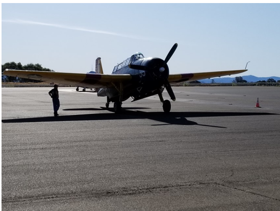
Aircraft on display.