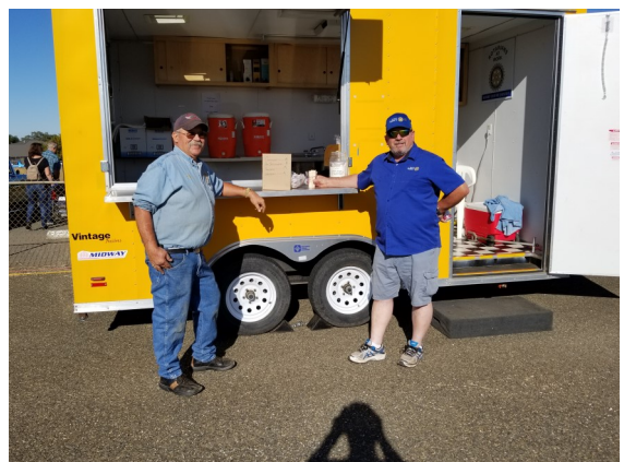
Rotarians working hard or . . .