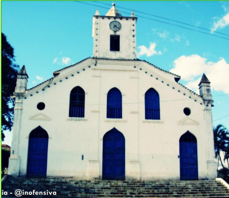
ia - @inofensiva