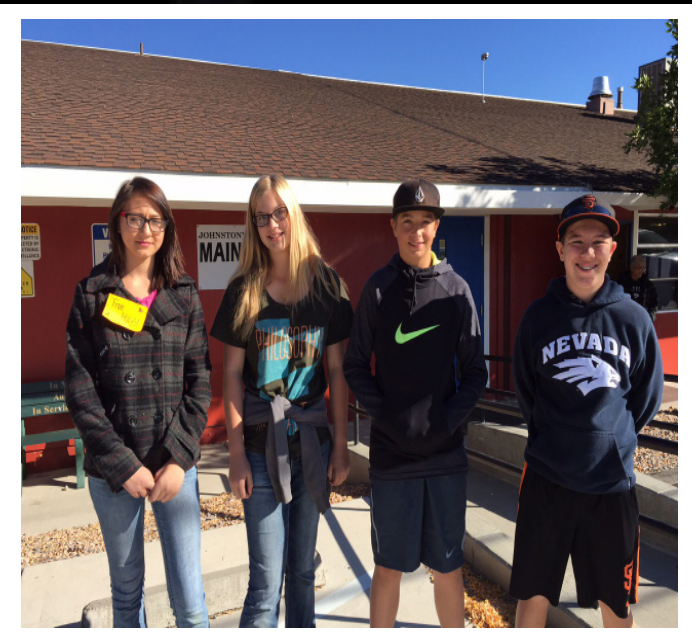
Johnstonville REGL (Rotary Eighth Grade Leadership) students ready for the trip to Grizzly Creek Ranch.