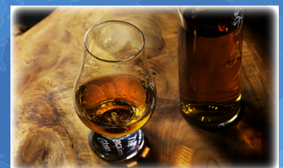
Whisky Tasting with Carl McDanel