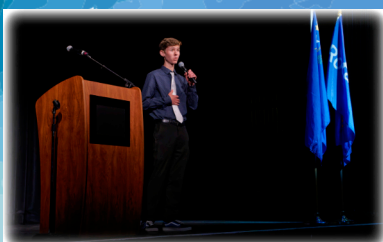
Student Speech Contest