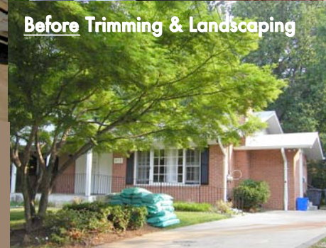
Before Trimming & Landscaping