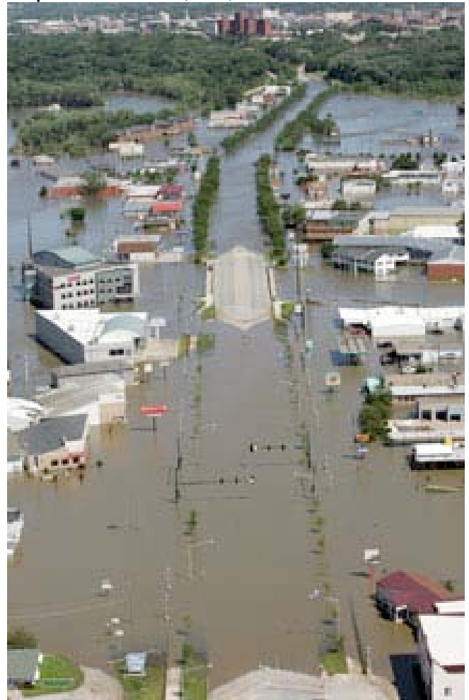
Iowa RI districts 5970 and 6000 established funds to help relief and recovery efforts for thousands of flood victims.