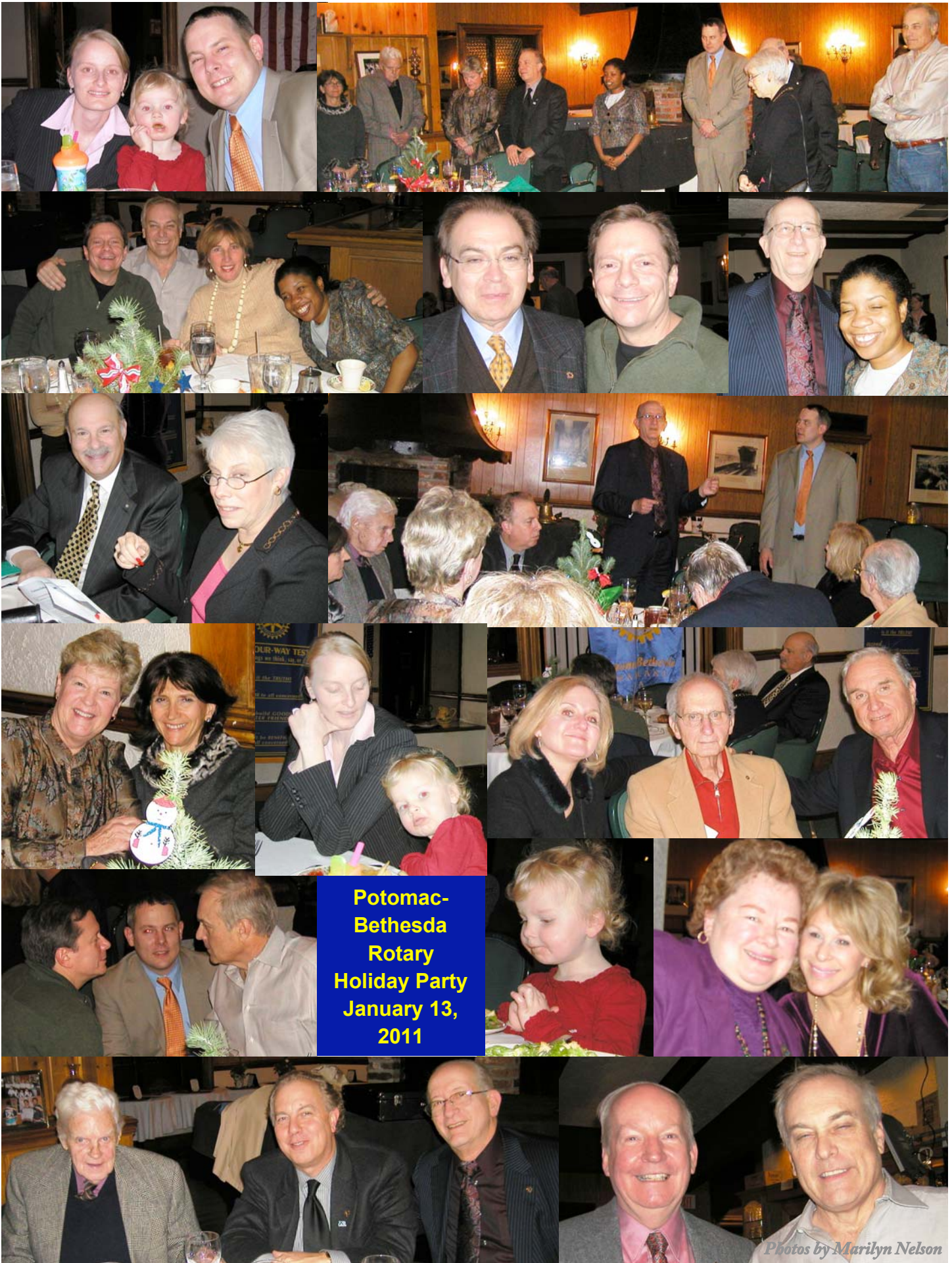
Potomac-Bethesda Rotary Holiday Party January 13, 2011