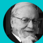
THE HON GARETH EVANS AC Former Politician & Academic