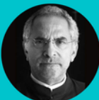
JOSÉ RAMOS-HORTA AC Nobel Laureate, Former President of East Timor

Listen to world class speakers Join a peace project How to develop a peace project Engage in facilitated discussions