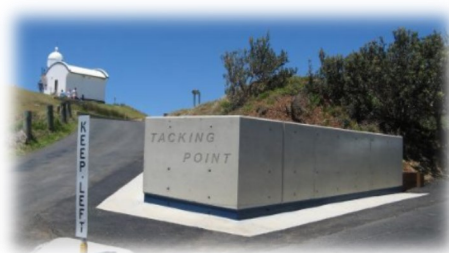
Tacking Point Lighthouse