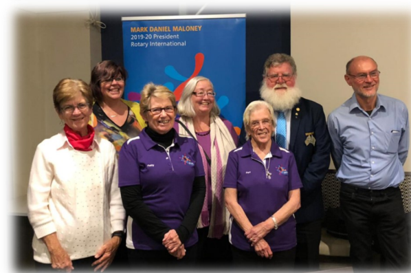
Above: The team at Woolgoolga featuring their new promotional shirts – the back reads "Talk to me about joining Woopi Rotary"

Rotary D9650 2019 Showcase Weekend at Tamworth: Saturday 23 Nov 19 & Sunday 24 Nov 19