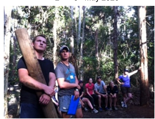
RYLA provides an opportunity to extend leadership skills & assists with personal growth. It is a powerful program for your community and for developing a sense of community and through developing future community leaders.

Lake Keepit Sport & Recreation Centre 2^{nd} - 9^{th} May 2020