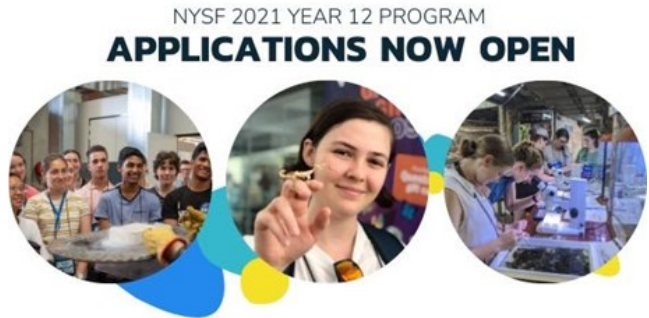
STEM LAB VISITS • LECTURES • SITE TOURS • WORKSHOPS • SOCIAL EVENTS

Lets make an effort to advertise and promote this program so that our young people can live a life with a group of positive and caring people as Rotarians are.