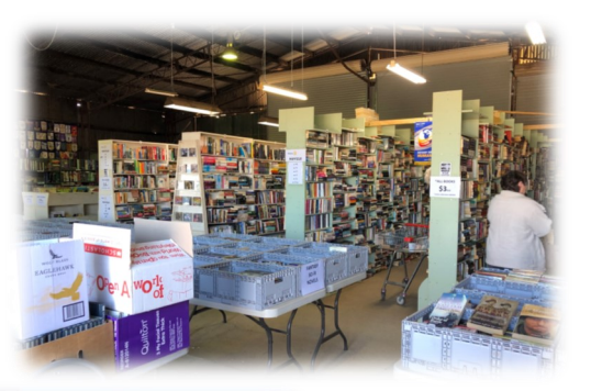
Photo Right: Rotary Club of Tamworth's Book Sale shed-amazing Open twice a week and sales exceed $1,000 every week.

Photos from DG Phil & Bronwyn's Rotary Club visits last week. These photos tell some of the valuable insights and activities that our DG and Bronwyn experienced this last week.