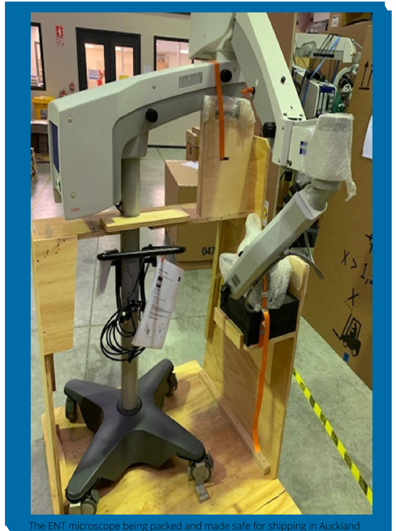
The ENT microscope being packed and made safe for shipping in Auckland

Thanks to 2 Rotary Clubs in D9820 in Australia, a donated microscope in New Zealand in D9920 can travel across the Pacific Ocean to its new home which is also in D9920.