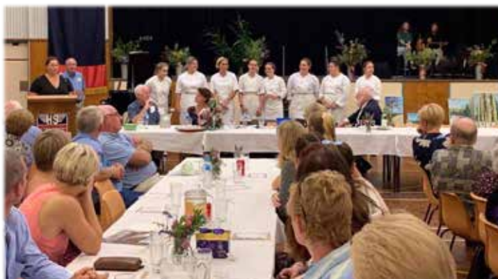
Wingham Rotary Club congratulating the Wingham High School students who catered the meal.