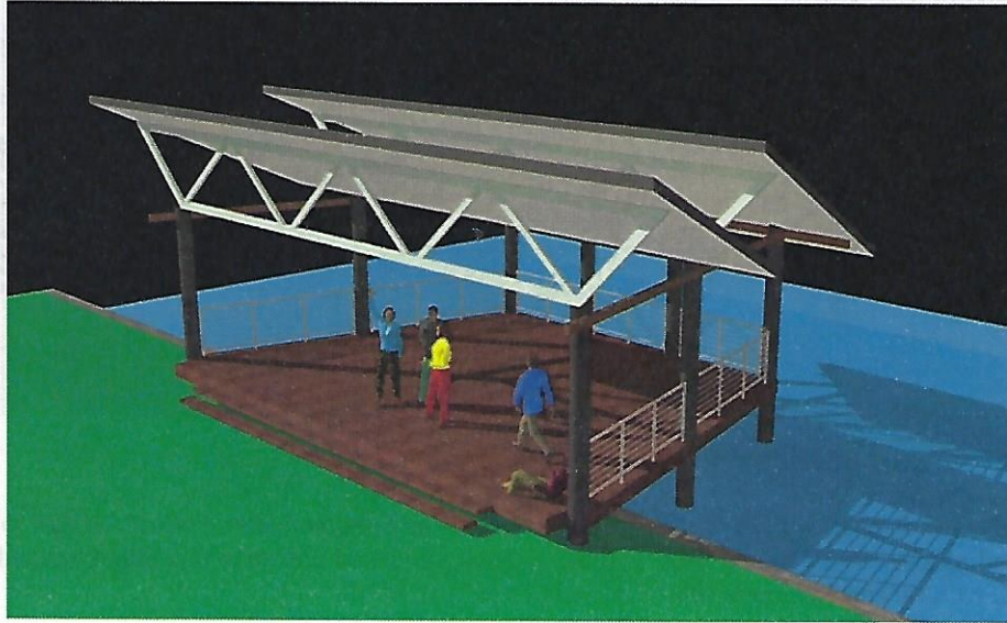
An artist's impression.

Following the successful application for Stronger Communities funding from Mid Coast Council, the combined community services clubs of the Manning Valley are well on target to build a signature stage facility on the banks of our magnificent Manning River.