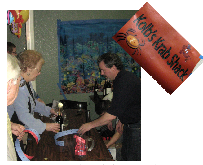
Our bar stays busy during the evening.

All other Wed.: Whitney Oaks Golf Club 2305 Clubhouse Dr., Rocklin, California