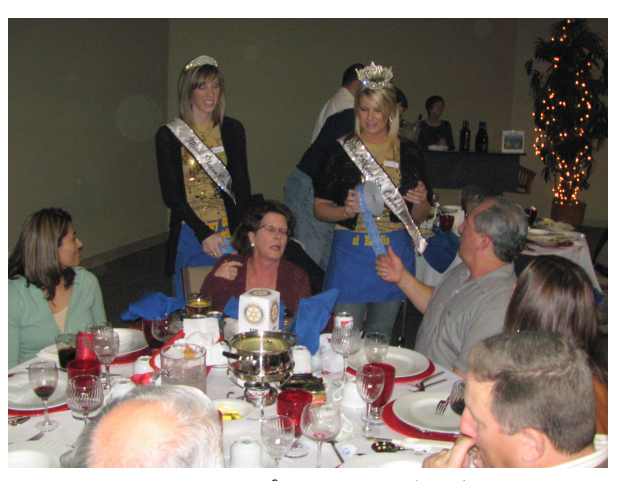
VIP treatment for sponsorship tables!