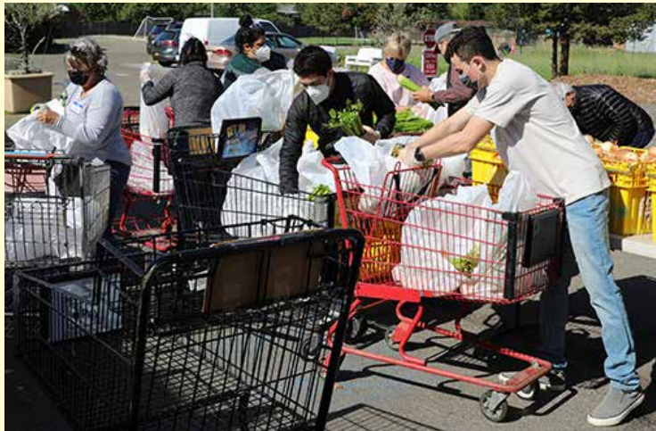
High School students help bag groceries and earn community service credits.