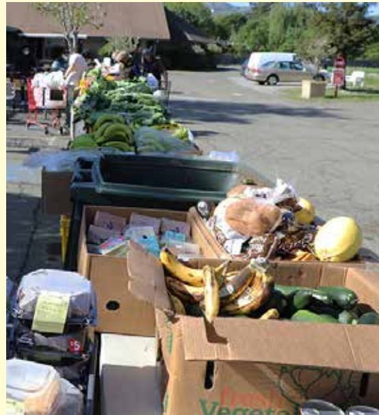
50 feet of fruit, vegetables, cookies, and canned ham ready for bagging by volunteers.