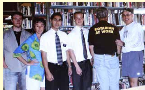
2005 Books for Ghana with Rotary Club of Novato helpers.