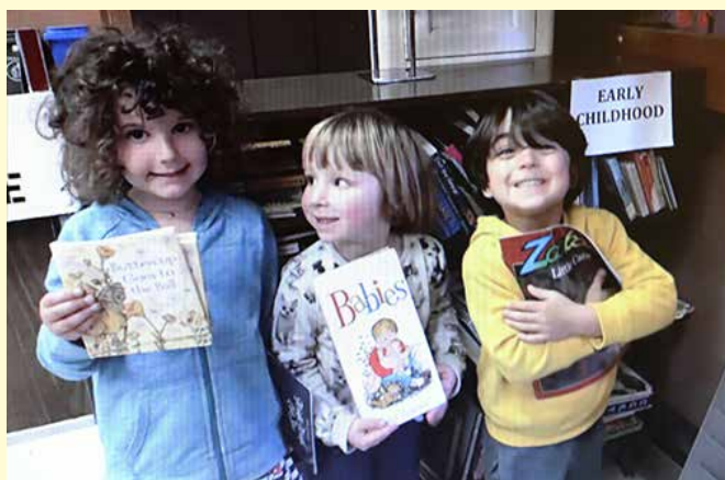
Rotary paid for buses for trips for Title 1 lowest income schools in Marin for a book field trip.