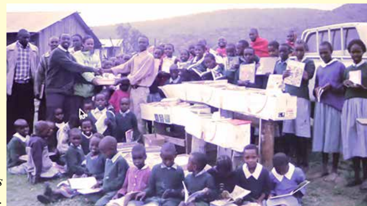
Ghana receives books.