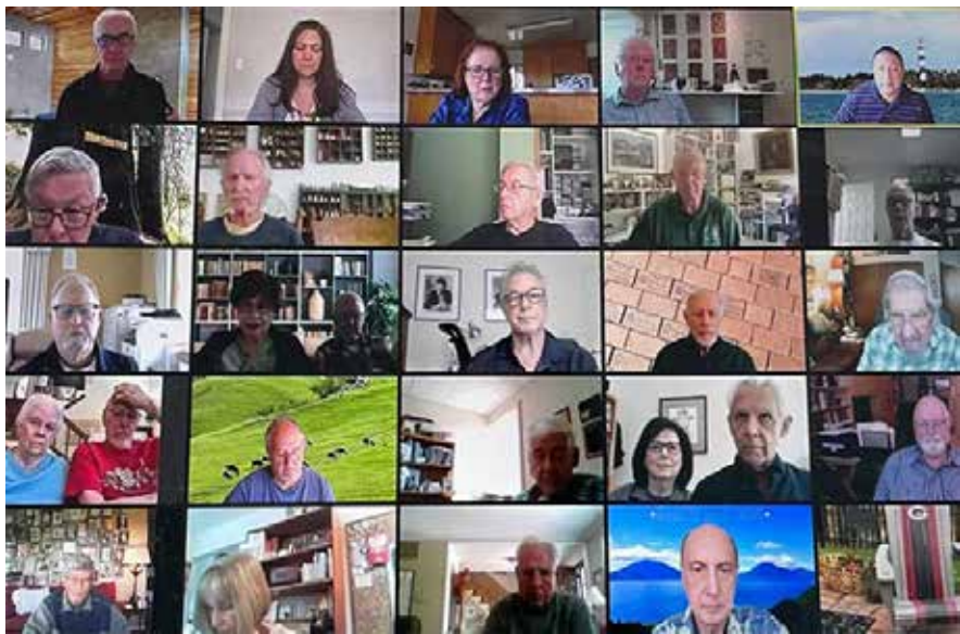
Rotary Club of Novato Zoom meeting participants.