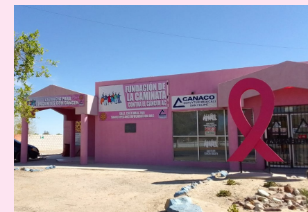
Street view of the clinic.