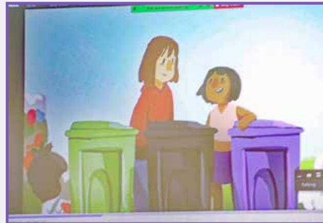
San Marin High School took 1st, 2nd and 3rd place in Don't Litter video contest.