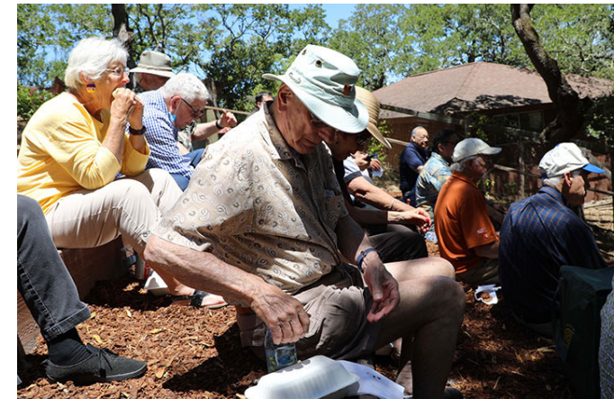
Memories of summer camp.