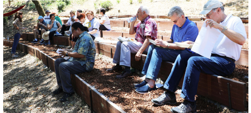
A picnic in the woods.