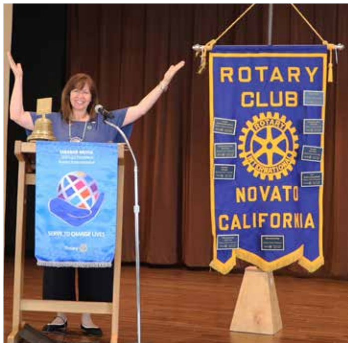
A grand welcome to the Rotary Club of Novato - positioned for future growth.