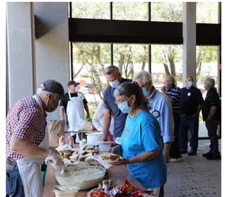
Like old times with a new view.