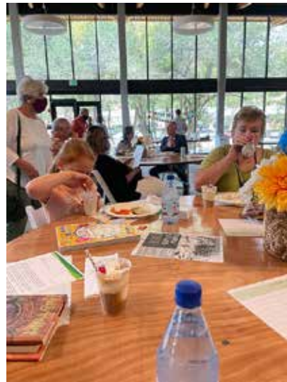
Enjoying lunch at the Bill and Adele Jonas Center