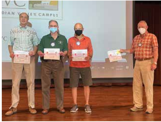
Rotarians receive PolioPlus Society certificates