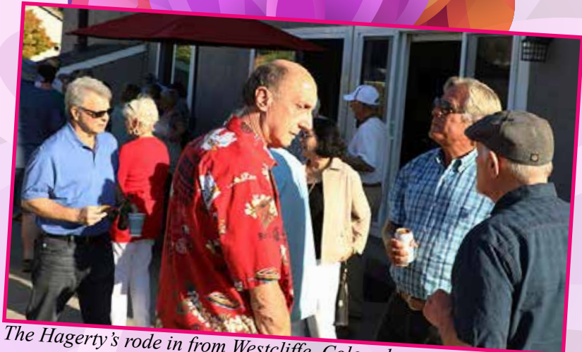
The Hagerty's rode in from Westcliffe, Colorado.