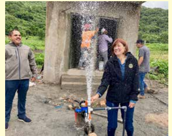
Sprayed by water.