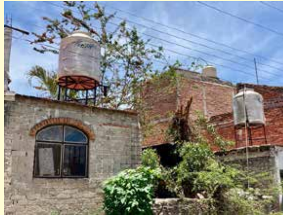
Tinacos and pumps on roofs.