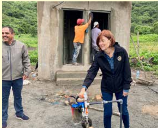
Turning the valve.