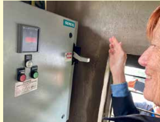
Flipping the switch.

Your money at work. Novato Rotary supported a Global Grant to bring water to the village of Ojo de Agua in the state of Jalisco, Mexico. The Rotary Clubs of Chapala Sunrise and South San Francisco led the project which is providing a well, pump, storage tank and distribution pipes so that the people in this village will have clean, safe water. Our own Al Angulo visited Chapala Sunrise with the Rotary Club of Lincoln prior to our joining this project.