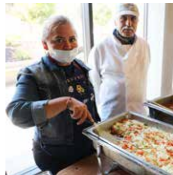
Best chicken enchiladas ever.