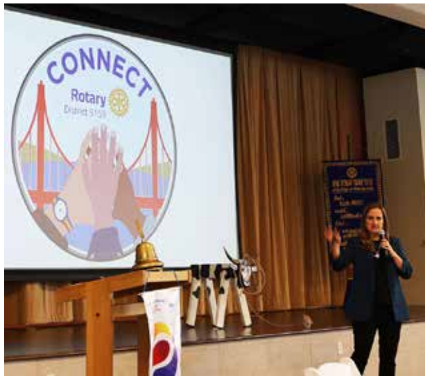
Our DG explains the new Connect Rotary logo showing symbols of diversity.