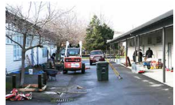
Early Sunday Rotary work stations at Lynwood Elementary School yard beautification.