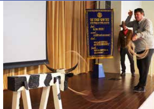
On behalf of our Western BBQ & Dance, members tried roping a cow.