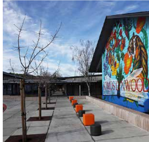
Lynwood Elementary School landscape beautification by the Community Service Committee of Rotary Club of Novato.