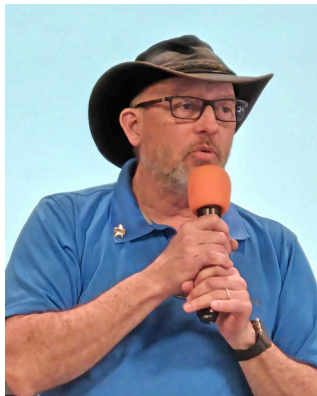
Asking for crafty members to make crocheted hats for new borns for warmth.