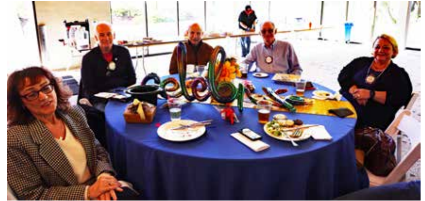
Birthday Table #1