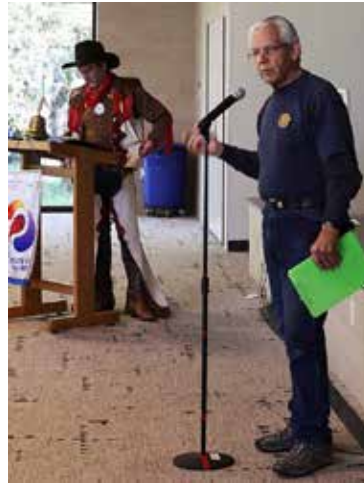
Show up at sunrise to beat the rain at Scottsdale Sign Ceremony.