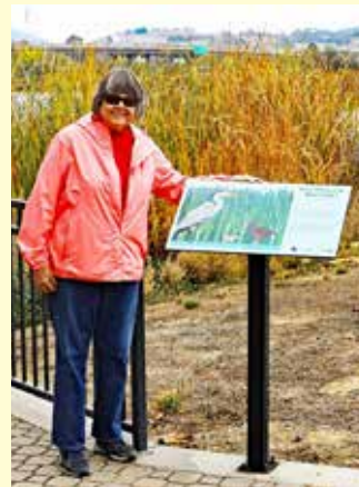
Sign installation