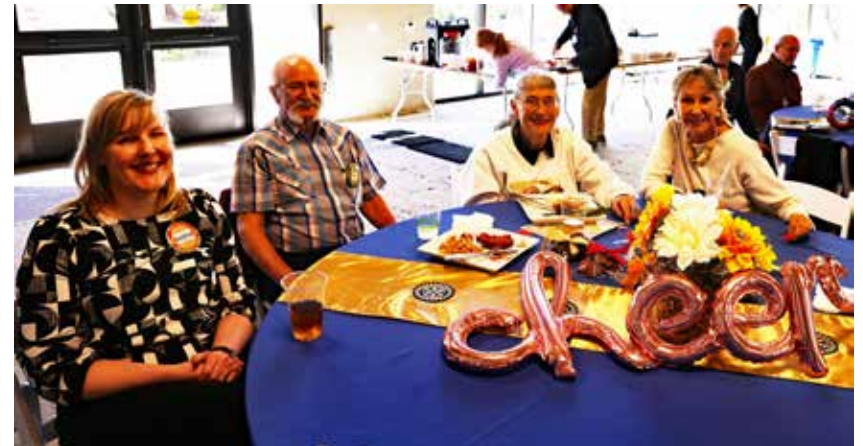
Birthday Table #2