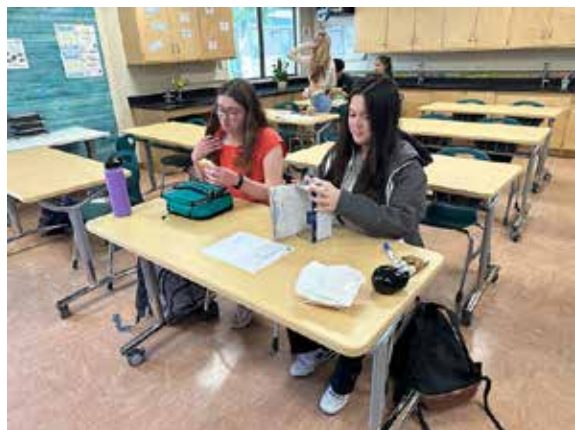
Interactors creating battery recycling boxes for San Marin High School