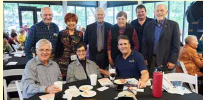
Rotary Club members attending the ESCOM 50th Anniversary Celebration.

October 20, 2023 Vol. 75, No. 15 Editor: Mister E. Editor