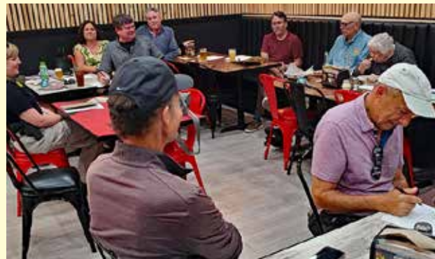
Community Service Project Meeting.