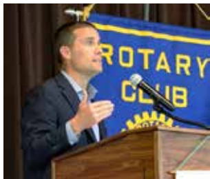
California District 2 Senator, Mike McGuire