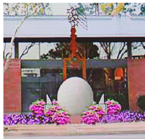
Proposed Grant Ave. installation.