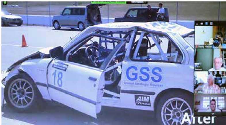
Mild mannered metal importer born to be wild.