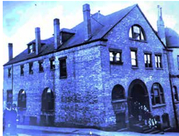
920 Sacramento Street in the 1870's was a women and girls refuge.