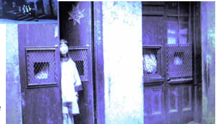
Historic Chinatown SF sex trafficking.