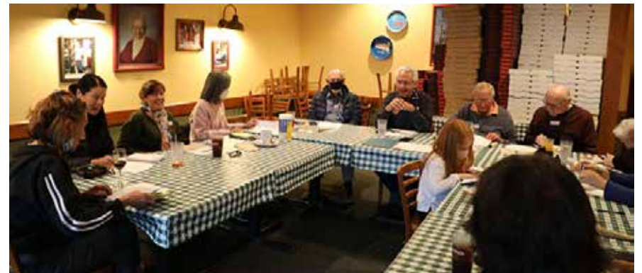
Rain, pepperoni pizza and Rotary! A wonderful assortment of new, past and future Presidents plus three new members.