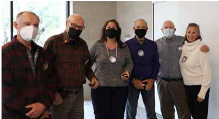
Rotary Foundation donors.