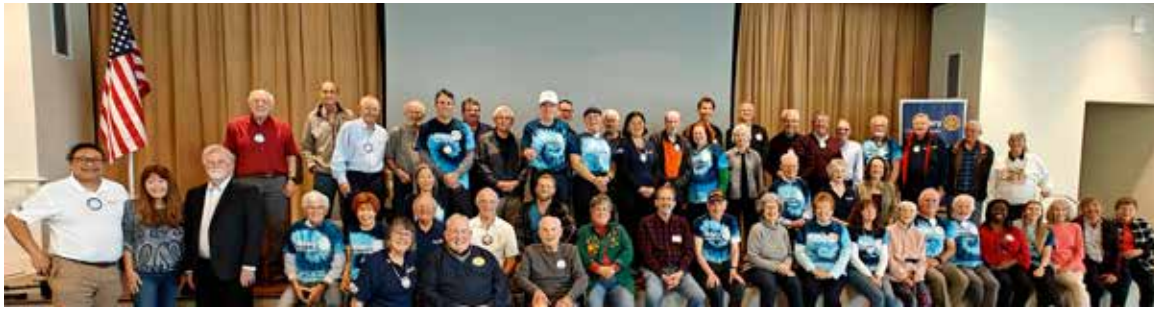
Annual Membership group photo.