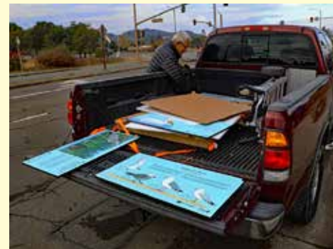
Chairman of Community Service hauls the new signs by Novato artist and produced in New York and installed by Rotary members on November 16.