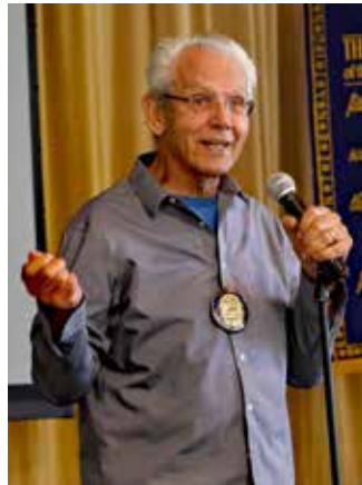
Community Service Committee commends Bahia Lagoon Restoration Volunteers.