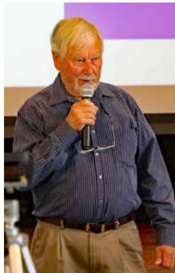
VFW Commander introduces Veteran guests.