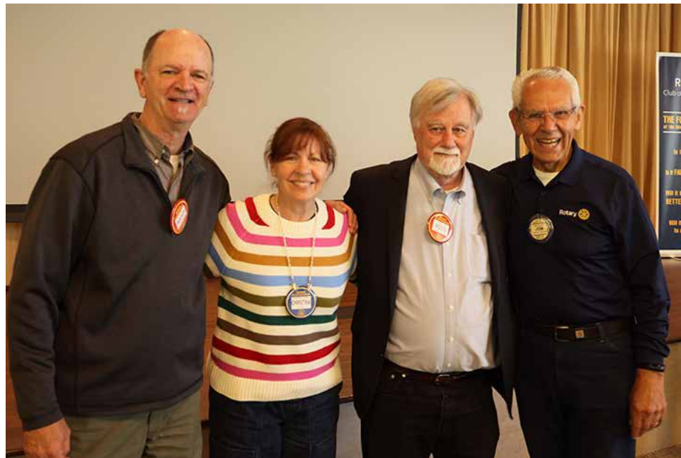
Two new members with sponsors.