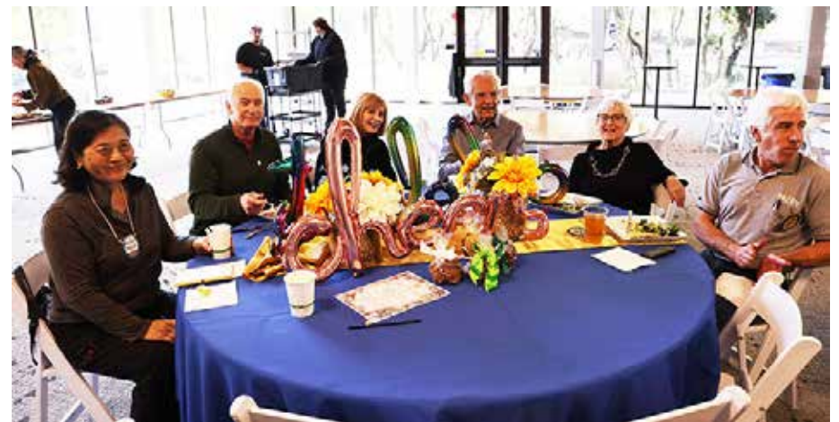
December birthday celebration table.