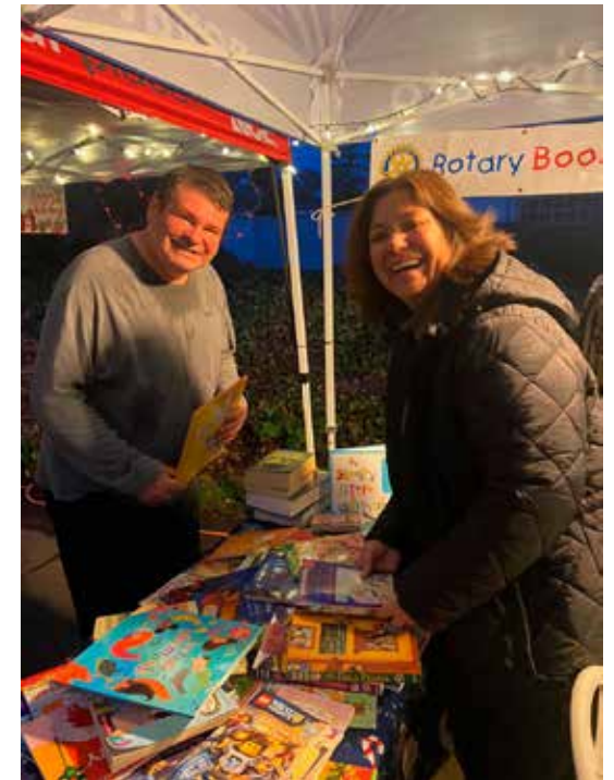
Rotary Books and Art Around Town at the Novato Tree Lighting.