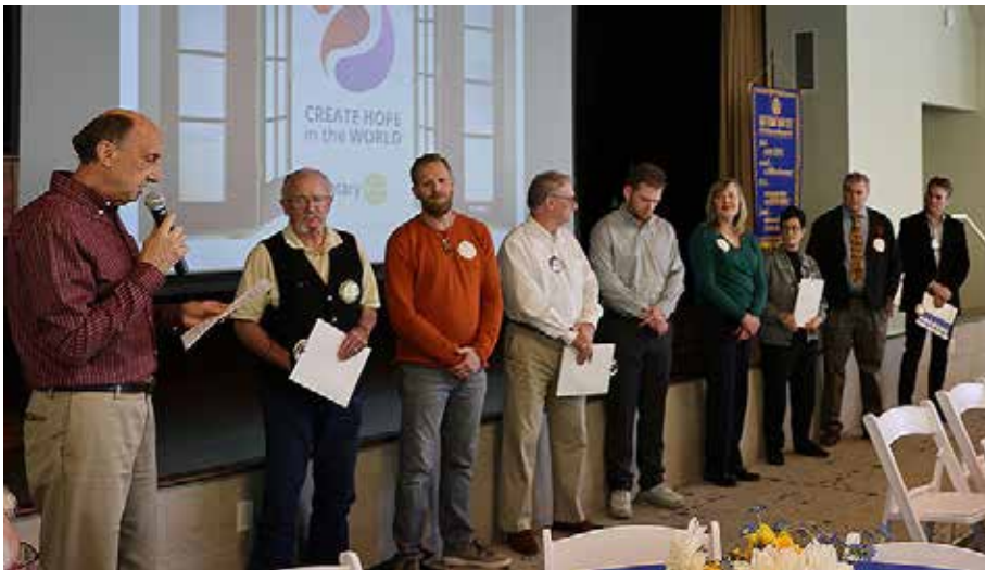
New Member Induction.