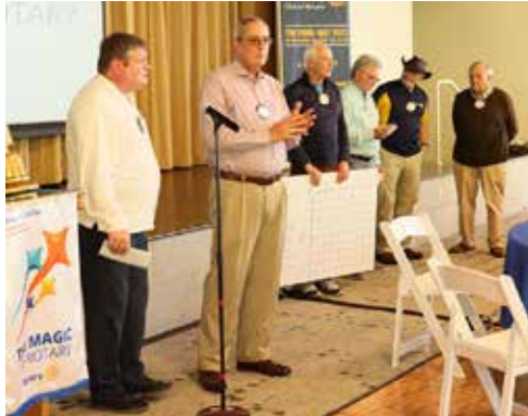
Announcing the Western BBQ, Xmas Party, Travel, Community Projects, Veteran Gift Cards.