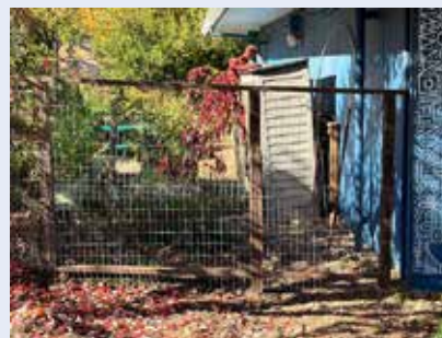
New garden enclosure.