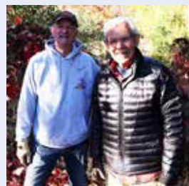
First Elves in the garden.