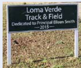
Loma Verde Track and Field saved by Cutrufelli back hoe drain clearance.