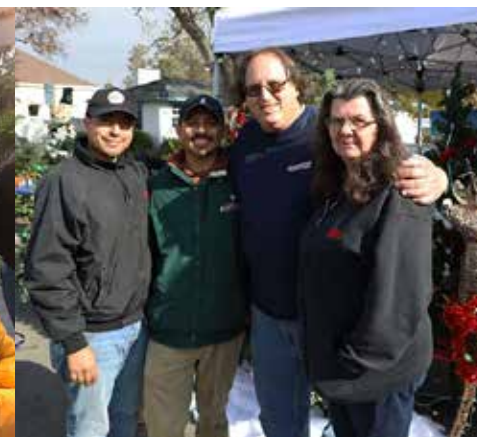
Books and Art Around Town at the December 4th Tree Lighting Ceremony