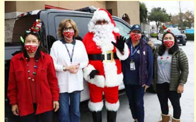
Heroe’s and Helpers handing out Target gift cards to families in need.