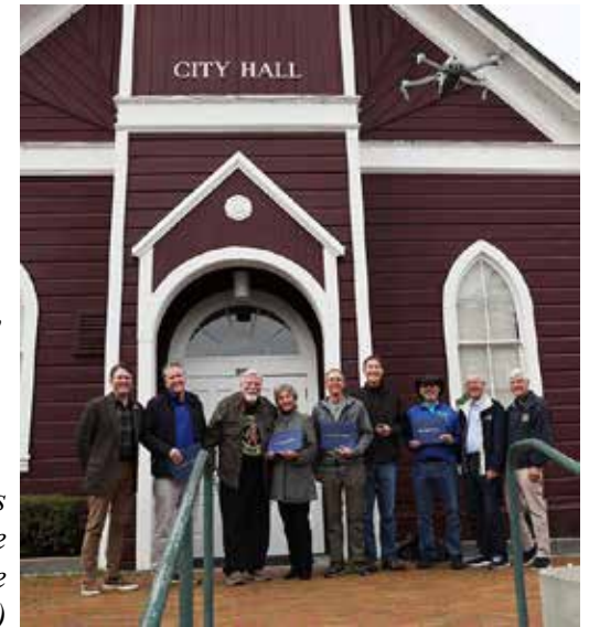
Paul Harris contributors in attendance were photographed from above and below (see drone.)