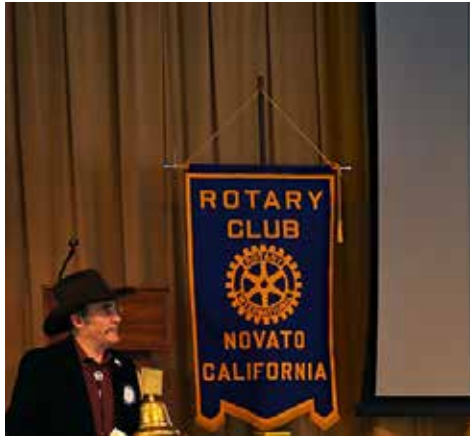
Ground Hog Day Trivia with Phil.